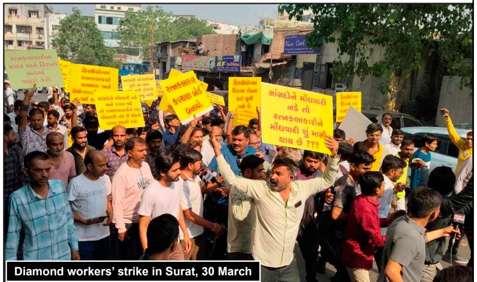
Diamond workers' strike in Surat, 30 March

This industry, which employs 100,000 workers, mostly in small "units", processes 90% of the world's diamonds, 80% of which are exported to the US. Bosses claim demand has slumped and will no doubt add Trump's tariffs as another reason to refuse workers' demands. Spreading the strike even further - across all of Mumbai's industries - would certainly make them think again. □