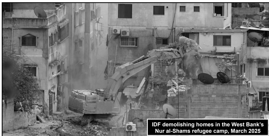
IDF demolishing homes in the West Bank's Nur al-Shams refugee camp, March 2025

The IDF is randomly killing people in the streets again. Trump has sent a new envoy, billionaire banker, Steve Witkoff along with Secretary of State Rubio, to negotiate a new agreement, while all aid into the Strip is being blocked by the Israelis. They've also cut the electricity supply to Gaza's only water desalination plant, which is now running using generators.