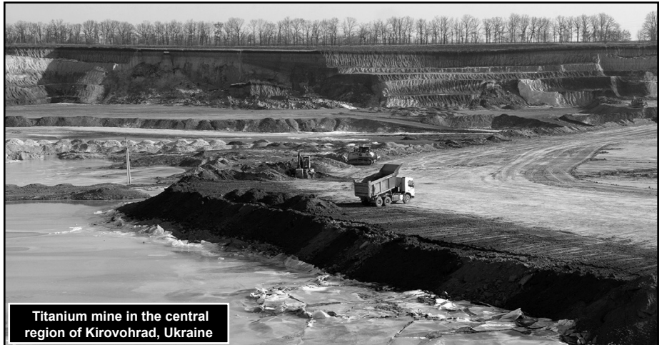
Titanium mine in the central region of Kirovohrad, Ukraine

what's being discussed, or rather imposed on Ukraine, is the financial and legal conditions under which US capitalists will be able to exploit, and perhaps own, these resources.