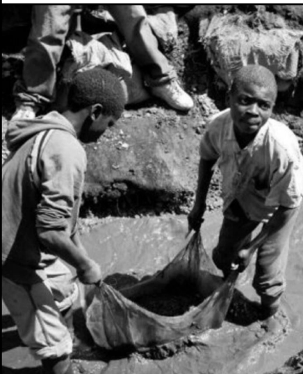
Children at work in a mine in the Katanga region of DR Congo

"Rare earths" is the name given to 17 elements, none of which is well known, including gallium, germanium,