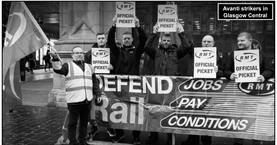
Avanti strikers in Glasgow Central