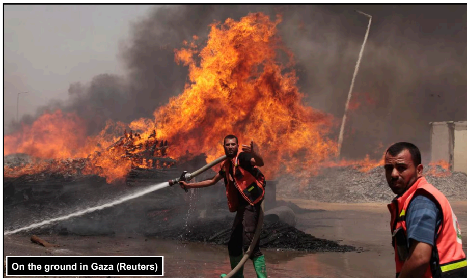
On the ground in Gaza

Fifteen months since this one-sided war on the Palestinians escalated, dozens are still being killed every single