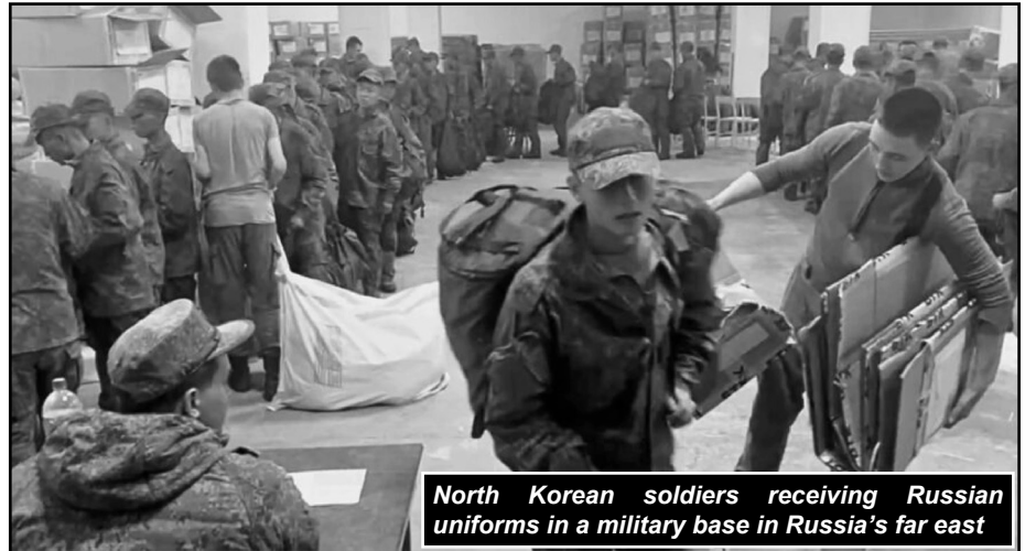
North Korean soldiers receiving Russian uniforms in a military base in Russia's far east

Western politicians have accused Putin and Kim Jong-un of crossing a red line. But this isn't the first time red-lines have been crossed in this war! Tanks and fighter jets and even long-range missiles were supposed to be excluded from NATO's military aid to Ukraine, until they weren't excluded any more. And since August, the Ukrainian army has been inside the Russian region of Kursk,