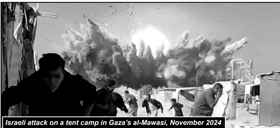
Israeli attack on a tent camp in Gaza's al-Mawasi, November 2024

The southern suburbs of Beirut are now bombed daily. The Israeli army and Intelligence services are determined to eradicate Hezbollah; an organisation that yes, is everywhere, since it enjoys widespread support in the population. So just as in Gaza, nowhere is safe. Of course the actors in this horrific war will have to sign a peace deal. But in the meantime there is storm before the calm. ☐