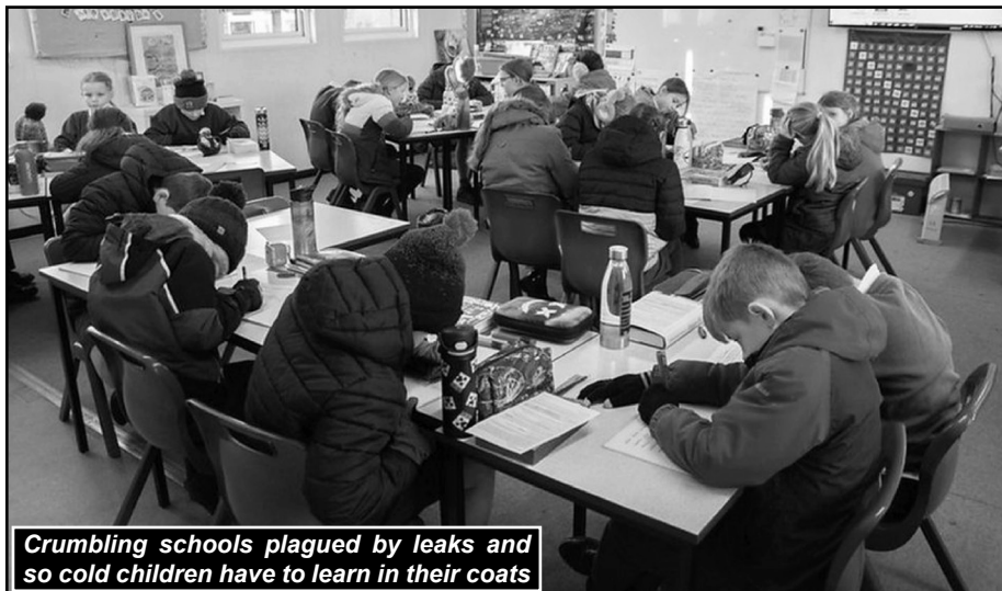
Crumbling schools plagued by leaks and so cold children have to learn in their coats

up by past and present inflation. Anyway, after years of underfunding in education it isn't even a drop in the ocean of need.