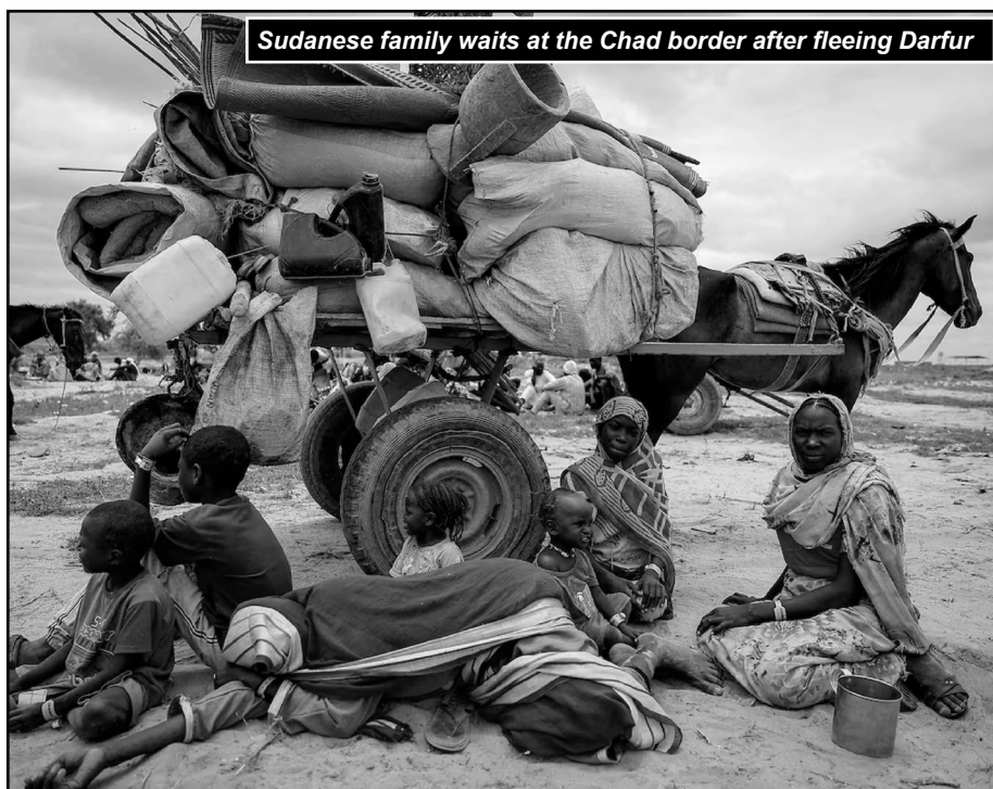
Sudanese family waits at the Chad border after fleeing Darfur

Today around 10,000 US soldiers and air personnel are stationed in 13 RAF-US bases around the country. They're not going anywhere. The British military hosts US operations in the Mediterranean and Near East via its base in Akrotiri Cyprus and the