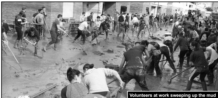
Volunteers at work sweeping up the mud

During the first 3 days of the flood there was no sign of firemen, policemen or soldiers - the first firemen who arrived were from Romania and France! In fact, soldiers stationed in barracks 40 minutes away from the affected areas were told