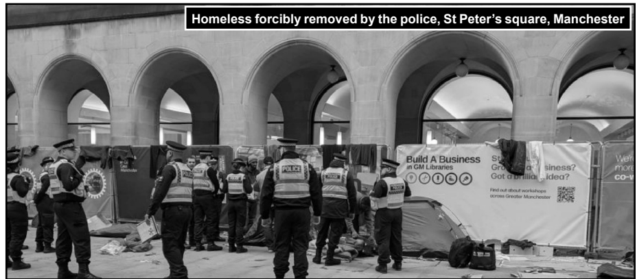
Homeless forcibly removed by the police, St Peter's square, Manchester

Councils covering nearly half the population of England have already warned of a £54bn funding shortfall over