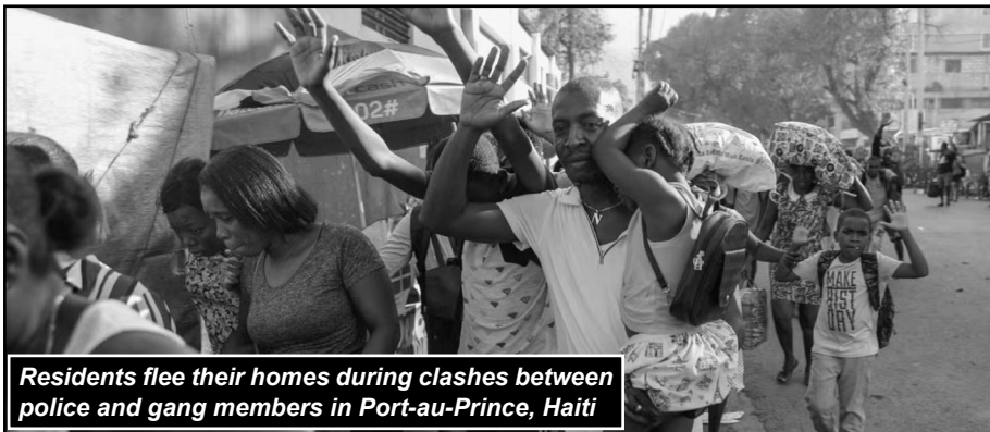
Residents flee their homes during clashes between police and gang members in Port-au-Prince, Haiti

In the end, effective resistance against the gangs will involve workers and poor developing and implementing a general plan, going beyond rooting out petty gangsters; they will need to root out the system of brutal capitalist exploitation run by the crooks at home and in the US - which is killing them just as surely, through the violence of poverty. □